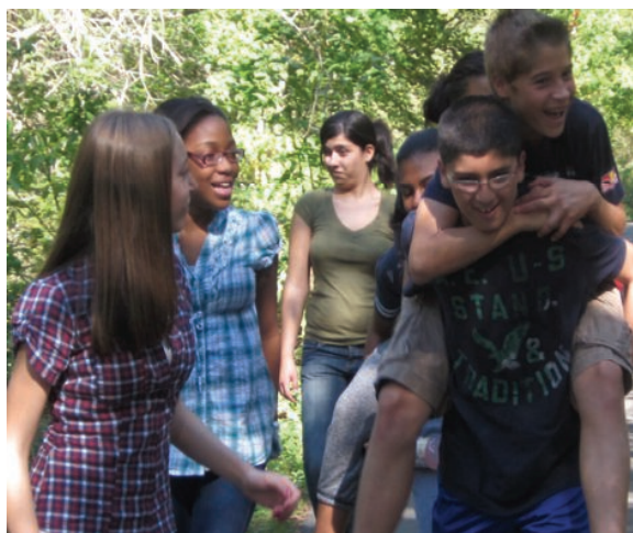
UMYF Hiking Trip at Massapequa Preserve.